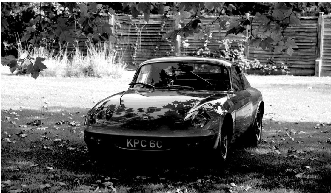
“Dream Team : Chassis by Lotus, coach work by Shapecraft, twin-cam by Holbay”